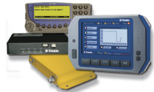
In-Vehicle Hardware Enables Real-time Tracking and Communications with Field Technicians