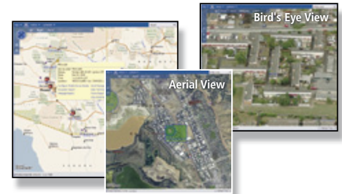
Web-based Software Provides Maps and Reports for Managing Vehicles and Mobile Workers

Trimble Utility Fleet Manager provides a powerful solution and with complementary functionality to our existing Trimble Fieldport® and Trimble UtilityCenter® software. These complete utility solutions provide the ultimate in cost efficiency and savings for your mobile workforce.